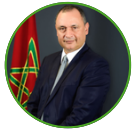
Mr. Ryad MEZZOUR Minister of Industry and Trade

Institutional speeches and strategic framing